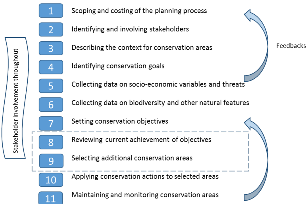
Fig. 1 The primary stages of systematic conservation planning [modified from 9]. This is an iterative, rather than a linear process, with feedbacks in light of new data or logistical considerations. The box around stages 8 and 9 indicates the spatial prioritisation stages during which computational decision-analysis tools are often used. This figure represents the dominant framework available for systematic conservation planning and has been adopted in the pending World Commission on Protected Areas (WCPA) Best Practice Guidelines [77]

As an inclusion criterion for this systematic map, we therefore define systematic conservation planning as a process for locating and implementing conservation actions where: (a) the benefits of conservation actions are specified either as threshold amounts of natural features to be represented or as continuous functions with increasing amounts of features; and (b) the outputs are one or more optimal or near optimal sets of spatially-bounded conservation actions (Table 1) (this requires a definition of conservation actions, which we here define as legal demarcations and/or management interventions to promote the persistence of biodiversity and other natural features in situ [18]). This means that plans will necessarily use existing, purpose built (e.g. Marxan [19],